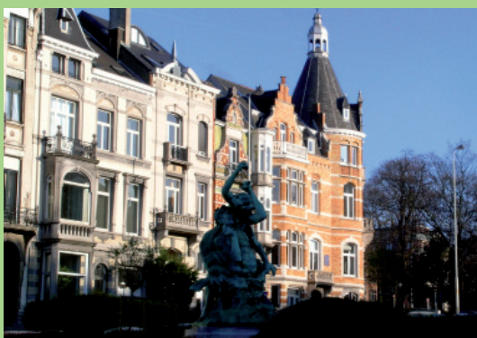
The ZealandDenmark EU Office is based in the Baltic Sea House, at the Square Ambiorix, a few hundred metres from the EU Commission